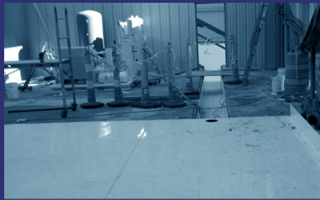
Installation of pit liner