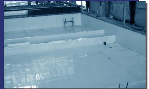
Lined pit with divider walls (after)