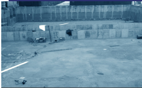
Concrete pit (before)